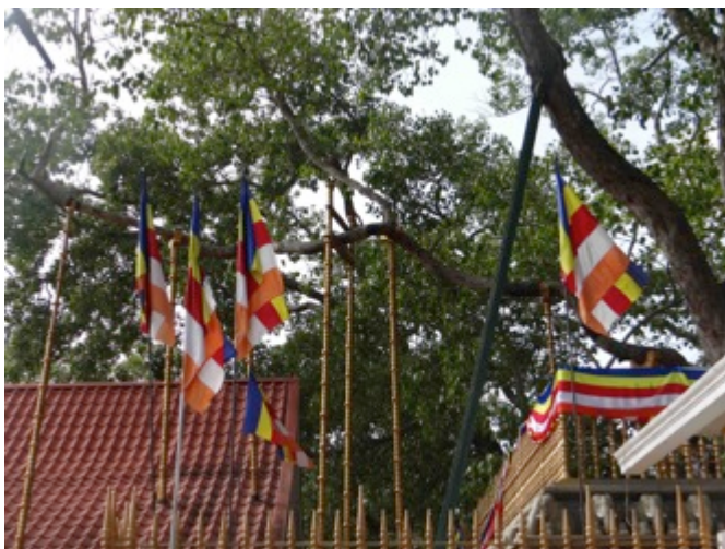
The oldest known living tree, this cutting from the original tree in India under which the Buddha sat to achieve enlightenment

We had a warm interesting encounter with a Buddhist nun. She was sitting in serene meditation. We took her photograph. She asked us to post to her (which we subsequently did). She has invited us to stay with her when we next go to Sri Lanka.