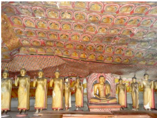
70% Sri Lankans are Buddhists

We both were surprised by our reaction to Sri Lanka. This truncated visit had revealed to us a country and a culture so different to our preconception of it.