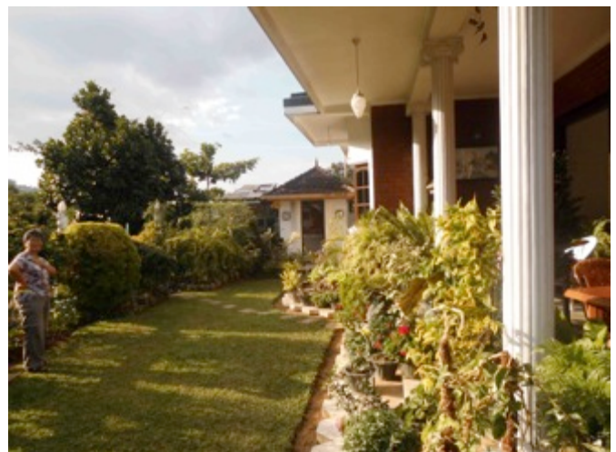
Our Kandy accommodation. Kandy Greenview Boutique

Perhaps it was the rarefied air but once we were back on the flatland and good pavement with few bends but lots of traffic I had trouble staying awake. It may also have been that it was after 2.30 and I was overdue for sustenance. However we negotiated the chaotic traffic of Kandy and Sunil took us to an expensive restaurant overlooking the lake and town and once replete we went to our accommodation, a lovely retreat.