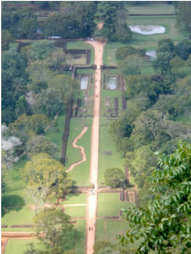
View of the gardens at Sigiriya viewed from the top of the rock 200 metres above. Only the left-hand side has been explored and restored.

It wasn't so far to Sigiriya but the journey passed through a surprising amount of forest including Minneriya Giritale National Park. Much of the road (even the hotel where we were staying) was lined with electric fences to keep elephants in or out. Apparently elephants come in to drink at the lake and pose some risk for the hotel guests if not fenced out. I hadn't expected to see so much forest in such a heavily populated island. Sri Lanka's population is 21,000,000 (almost equal to Australia's and occupies an area of 65,600 square kilometres (almost the same size as Tasmania 68,400 square kilometres). It makes the rate of destruction of forest in Australia even in Tasmania look horrific.