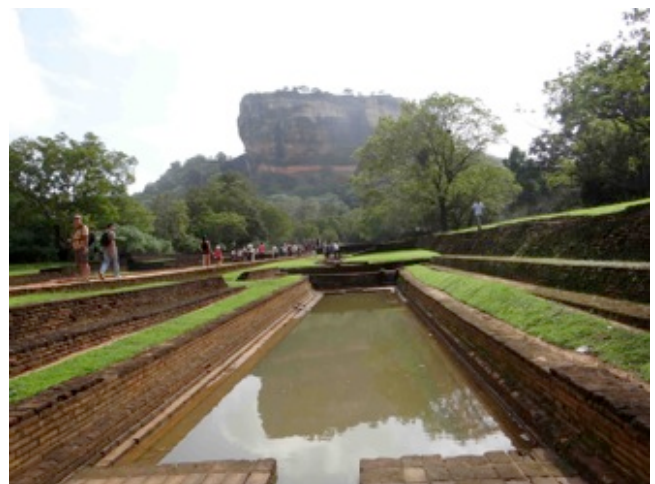
Sigiriya Rock as seen from the lower garden

After this site and topping up our fruit supplies at inflated prices we were taken to accommodation arranged by Sunil with some family connection. It was a very comfortable and very affordable B&B. Sunil celebrated by getting Su to polish off a large bottle of beer on her own and me to imbibe a fair slug of gin. They were really a knockout and we had to be wakened to have the dinner that we had ordered.