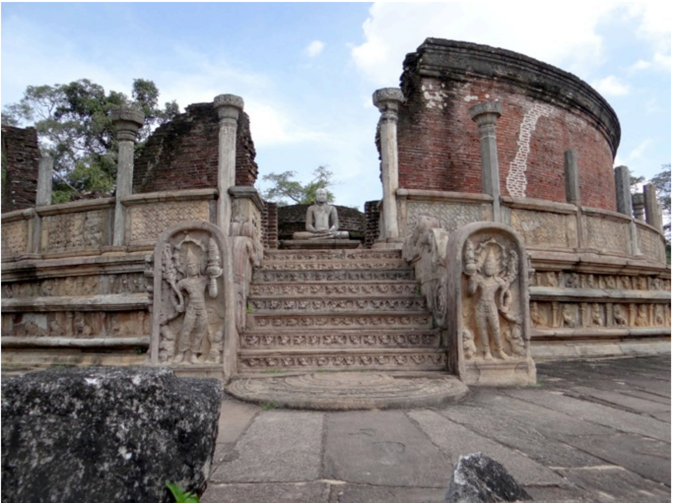
One of the many cultural heritage relics of Polonnaruva

We went to Sri Lanka to gain a better, more personal understanding of the people and cultures of this troubled country and to discover some of its World Heritage. We visited six sites all north and east of Colombo in the week we had there. We would liked to have seen more and left with a feeling that we would like to return soon.