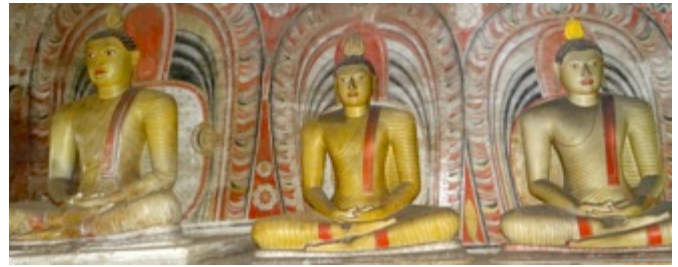
Buddha images and frescos in a Dambulla Cave

Almost as impressive as the rate of forest retention is the percentage of the wetlands one sees. Most of these are man-made wetlands with weirs and water storage for irrigation but all of the wetlands support an astonishing amount of wildlife. It appears that Sri Lanka was able to achieve so much as a nation because it developed the irrigation and water engineers so far back in history.