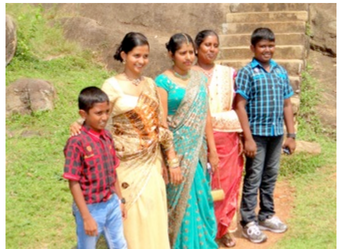
This Sri Lankan family group epitomises so much

It wasn't just the nature alone. The apparent good health of the people was evidenced by a beginning tendency to plumpness. Australia could learn a lot about public health and the emphasis by noting that Sri Lanka labels its relevant department " Health and Nutrition ". Public health is also reflected in the fact that despite the extensive wetlands that we saw, malaria is almost non-existent now although we were told that Dengue fever is on the rise.