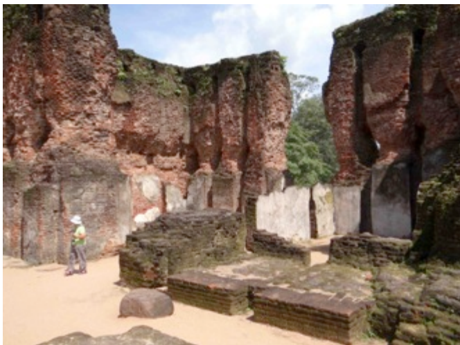
Remnant of Polonnaruwa Royal Palace

We next drove across the wall of the largest area of water in all of Sri Lanka, a great reservoir built over 1500 years ago as part of an irrigation system that fed the population in and around this Royal capital at least for 250 years between about 950 AD and 1200.